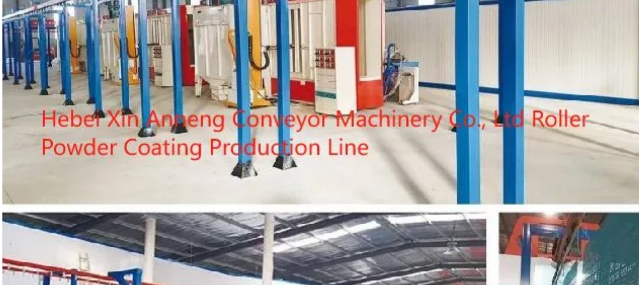
Hebei Xin Aneng Conveyor Machinery Co., Ltd Roller Powder Coating Production Line