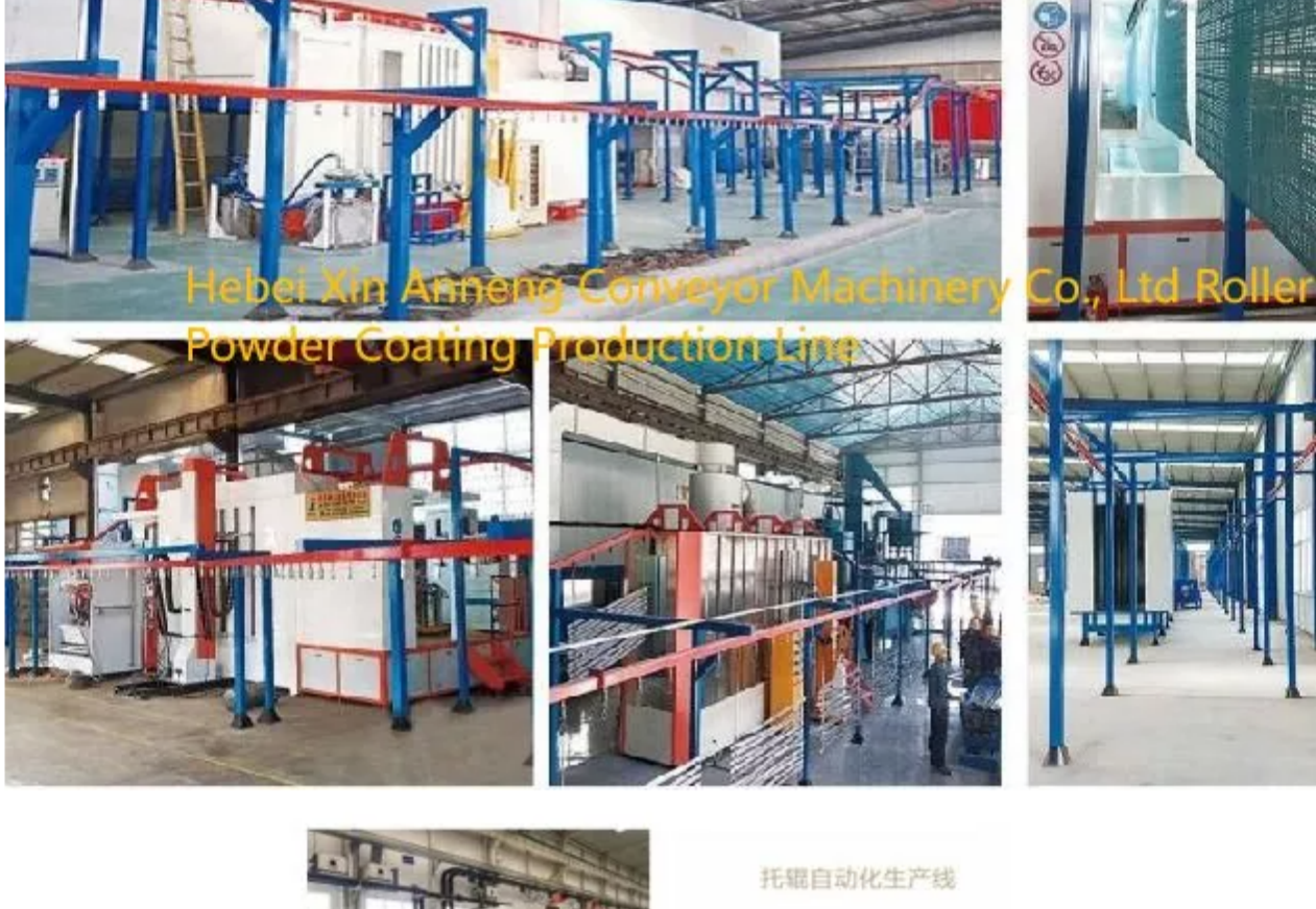
Hebei Xin Aneng Conveyor Machinery Co., Ltd Roller Powder Coating Production Line