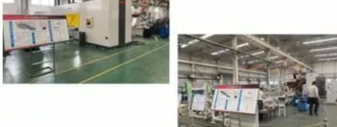
Hebei Xin Aneng Conveyor Machinery Co., Ltd -Fully automatic roller production line